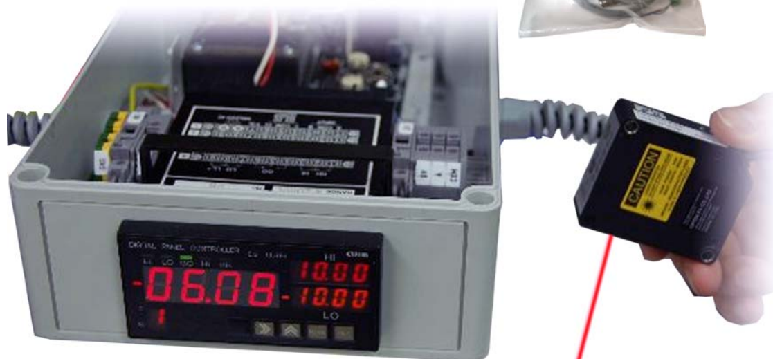
Example of a turn key solution wiring and pre-programming our laser sensor and panel meter.